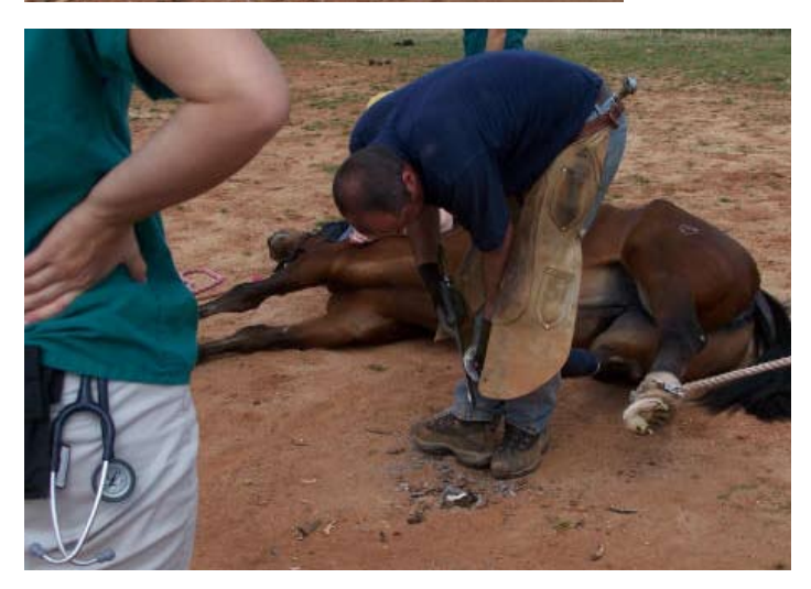
People say hoof work is a blend of art and science.... Add 'contortionist' to the list when the horse is laying down!